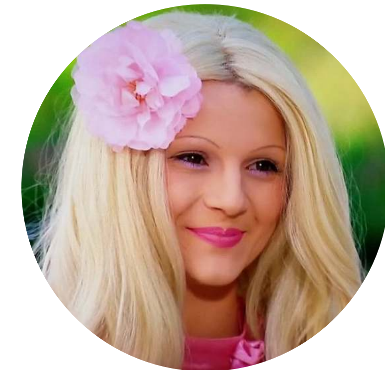
Leney Bear Builder